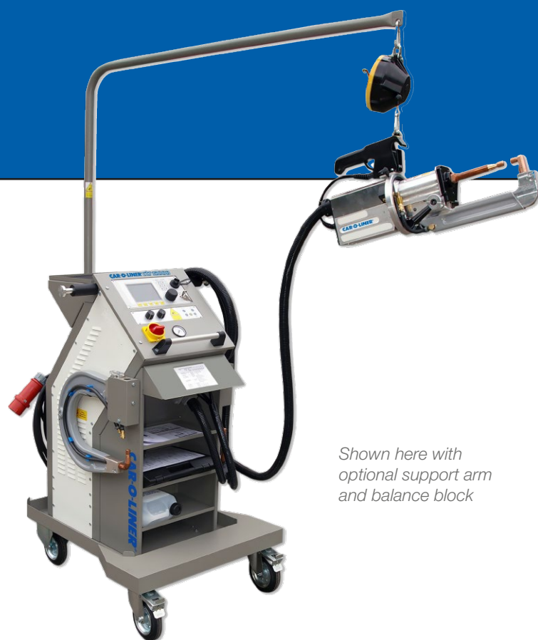
Shown here with optional support arm and balance block

This welding set is equipped with a transformer spot welding gun. This means the system places less of a strain on workshop power supply systems than conventional cable-type spot welding machines.