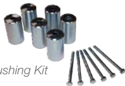
FORD F150 Bushing Kit