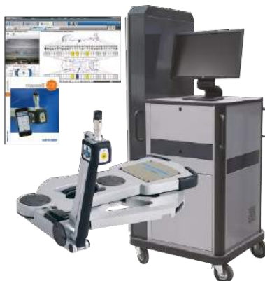
Car-O-Tronic Vision2 X3 Electronic Measuring System