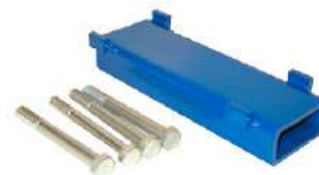
B213 Distance 50