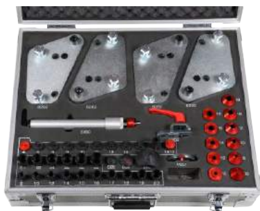
VAS 6600 Aluminum Holding Kit

Hold the AUDI vehicle securely on the alignment platform without damaging sensitive aluminum parts.