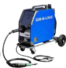
CMI273 & CMI273 Twin