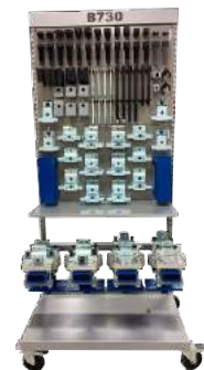
Truck Clamping System Hold the FORD F150 securely on the alignment platform without damaging sensitive aluminum parts.