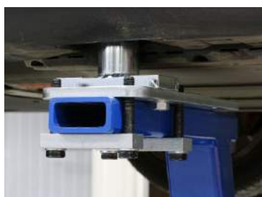
Tesla Bench Mounting Clamps