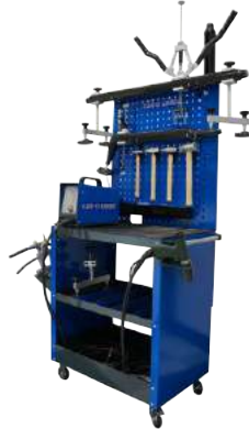
Aluminum Workstation Take control over your aluminum repair equipment