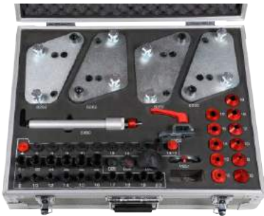
VAS 6600 Aluminum Holding Kit

Hold the PORSCHE vehicle securely on the alignment platform without damaging sensitive aluminum parts.