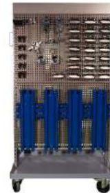
EVO Extension Kit