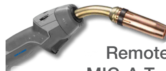
Remote control using the MIG-A Twist® welding torch

CMI3000II comes with the MIG-A Twist torch in an award-winning design. The unique, turnable swan neck of the MIG-A Twist allows access to hard-to-reach places. It is possible to mount different modules on top of the torch for adjustment of the most important welding parameters.