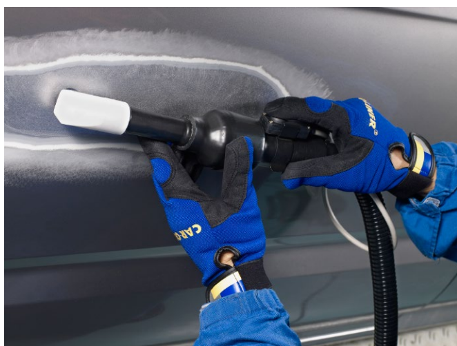
Heat shrinking of steel and aluminum panels during repair

Advanced induction technology means there is no open flame - the heat is generated directly in the work piece itself. The high power CH37 Induction Heater can be used as a gas torch but with little risk of damaging nearby components. The CH37 has a unique regulation and control system featuring five power levels, making it nearly impossible to overheat!