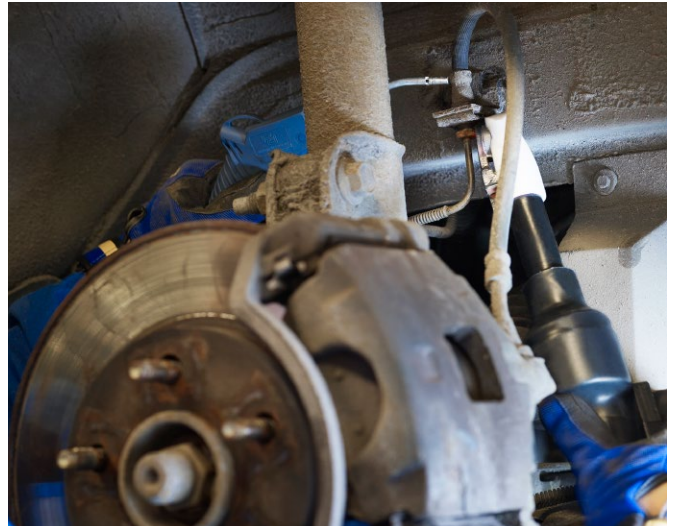
Does not overheat nearby sensitive parts