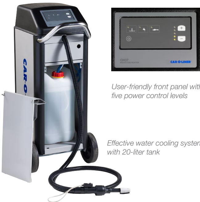
User-friendly front panel with five power control levels