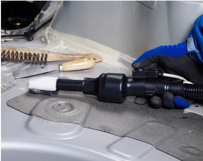
Heats through rubber and plastic