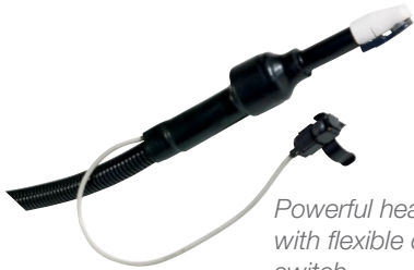
Powerful heating tool with flexible on/off switch