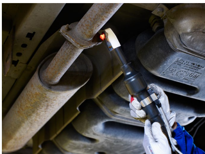
Heat rusted nuts and bolts on suspension, steering & exhaust